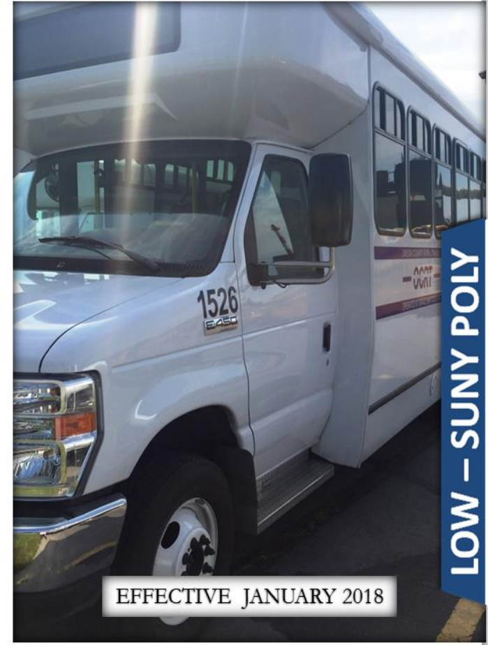
EFFECTIVE JANUARY 2018